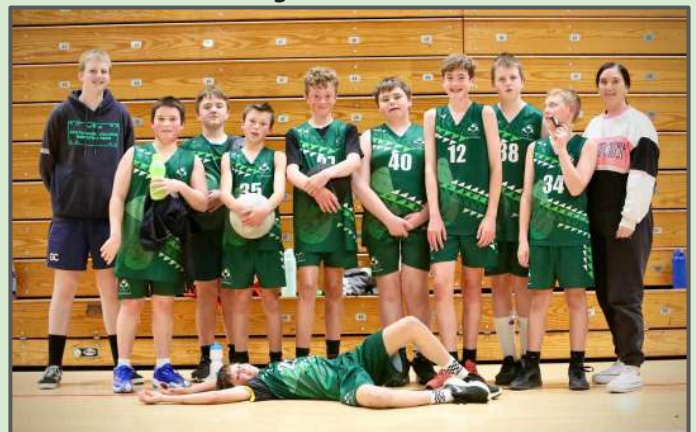
Below: Mangorei Bulls Basketball Team

Well done to our basketball and miniball teams that competed through the season, including those that made finals in their groups. You all did an amazing job, thank you to the coaches and managers for also putting in the hard yards helping our tamariki gain a love of this fantastic game!