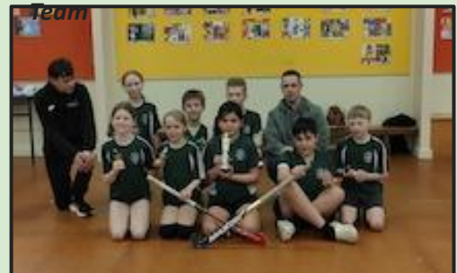
Below: Mangorei Tui's Hockey